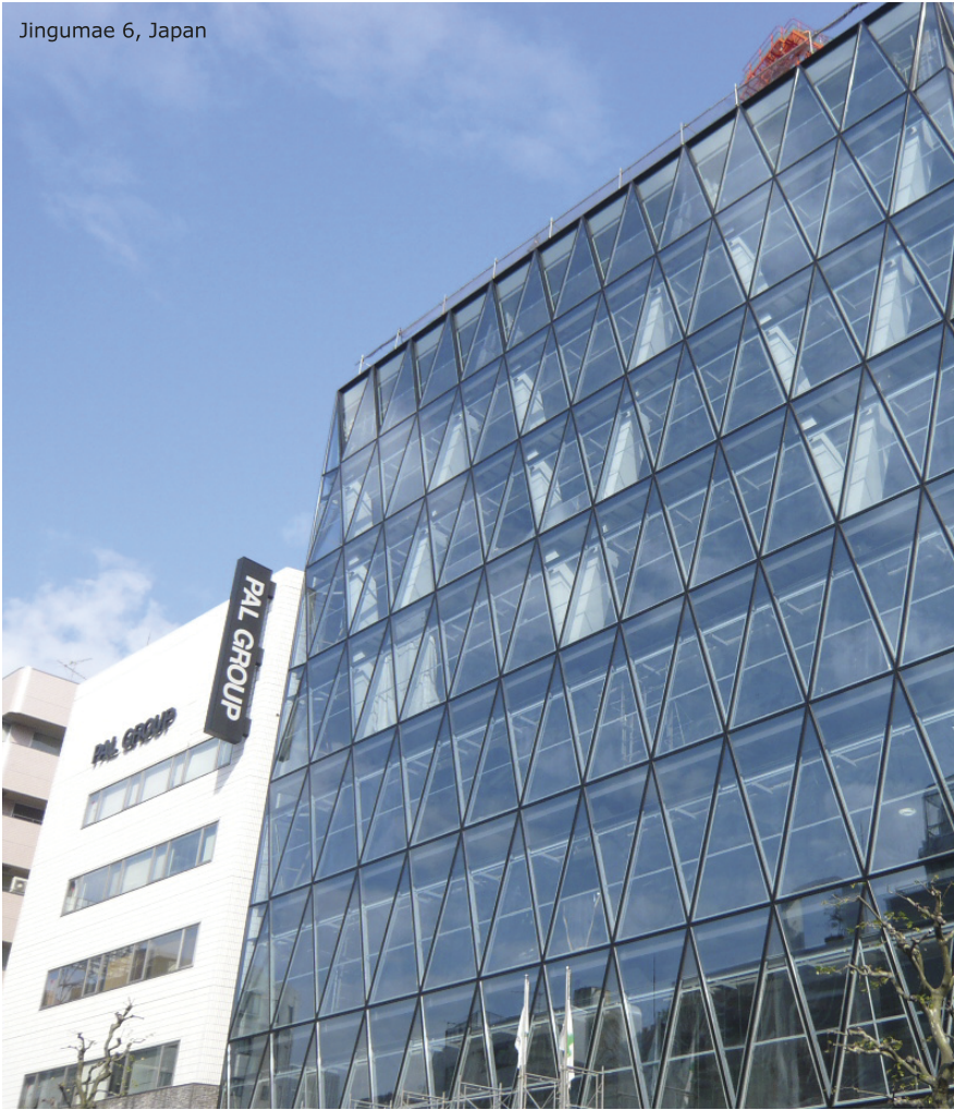
Jingumae 6, Japan

Annealed glass is a brittle material that breaks under low tensile stress. The exposure of annealed glass to wind load or extreme changes in temperature (about 40-50°C) can cause tensile stresses sufficient for annealed glass to break. In overcoming its fragility, a tempering process can be used to increase tensile strength of glass as a structural component.