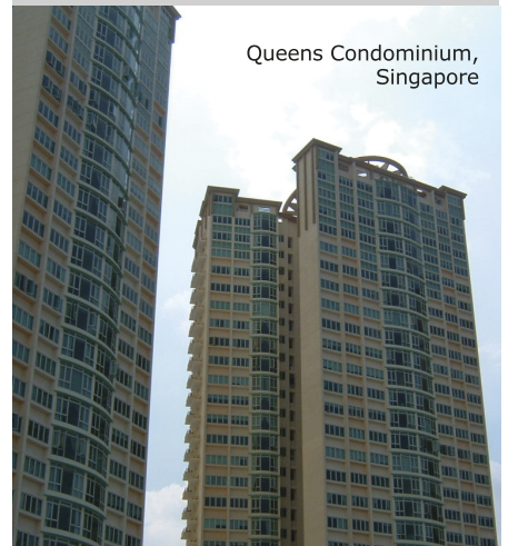
Queens Condominium, Singapore

breakages due to nickel sulphide formation can also be reduced via additional heat-soaking as featured in SSG® DuraGlas-Q.